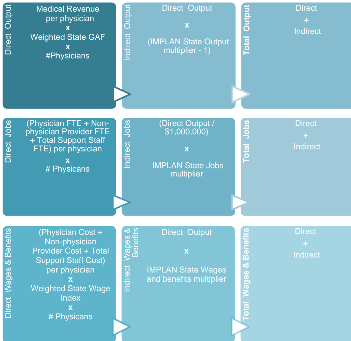
Figure 2. Overview of Methods