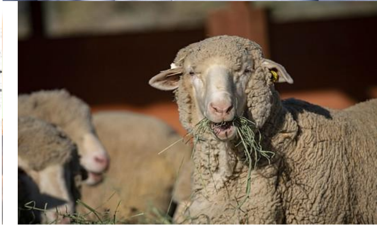
PRESENTATION TITLE